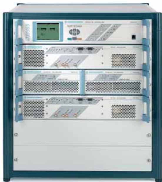
12.5 W DVB-T Transmitter R&S SV7002 with passive exciter/power amplifier and R&S NetCCU® 700

Integration of third-party components is easy due to the parallel interface option that is also available for the R&S NetCCU® 700.