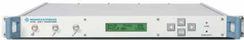
DVB-T Transposer Driver Stage R&S XV702

As an option, the R&S NetCCU® 700 can also include an ASI distributor required for exciter standby or passive transmitter standby. The emergency control provided in the unit ensures transmitter operation even if the control unit fails.