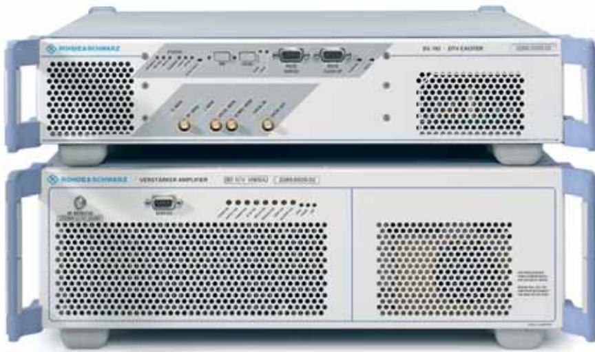
120 W Transmitter R&S SV7002 (table-top solution)